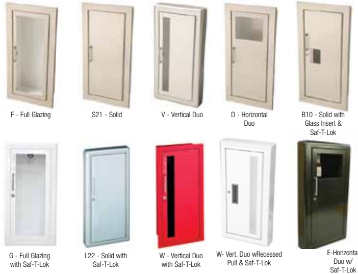
SELECTION CHART FOR AMBASSADOR, ACADEMY, COSMOPOLITAN SERIES