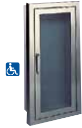
COSMOPOLITAN 1036F16 (POLISHED #7)