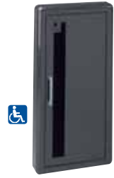
ACADEMY 1027V10 (DK BRONZE OPTION)