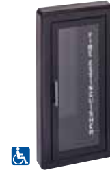
AMBASSADOR 1017F10 with Optional Lettering (BLK OPTION)