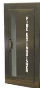
1045 WITH CUSTOM US10B FINISH & ENGRAVED/FILLED LETTERING