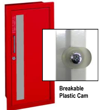
Breakable Plastic Cam

The SAF-T-LOK™ cam lock is centered top to bottom on the cabinet door, and can be installed on most door styles with the glazing option you select. Pull handles are installed 3-5/8" inches higher when a SAF-T-LOK™ is installed in your cabinet, except for the ADA recessed pull which is installed to the right of the lock.